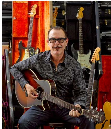
Kirk Pengilly of INXS with guitars consigned for auction

Kirk Pengilly commented: 'I have been collecting guitars over my 40 year career as a musician. This collection of instruments contains a mixture of rare and unique instruments ready to be loved and/or played.'