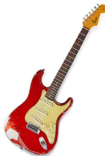
A Fender L-Series Stratocaster 'Candy Apple Red', 1964. Estimate $35,000-45,000

Encapsulating the striking character of 1980s design, the sale also includes eccentric models such as the sharply angular Westone 'The Rail' bass guitar (estimate $1,000-2,000) and the Vaccaro 'X-Ray' custom colour electric guitar (estimate $1,500-2,500) the latter of which is a rare one off by the son of the Kramer Guitars founder. A 1986 Westone Pantera X300 electric guitar (estimate $4,000-6,000) featured prominently as the lead rhythm guitar in the recording of the 1987 hit, New Sensation , one of the most recognisable guitar riffs in Australian 20th century music history. A selection of studio microphones from Rhinoceros Recordings, the Sydney recording studio of INXS will also be auctioned. Pengilly also acquired other rare vintage microphones from the ABC when they were modernising their studios, and these too carry an aura of a highly creative period in the Australian recording industry.