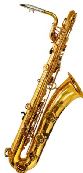
A Selmer MK-VI baritone saxophone, 1975. Estimate $8,000-10,000