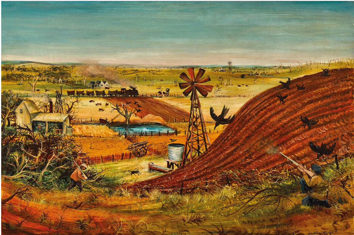
ARTHUR BOYD 1920-1999, Moby Dick Hill (1949). Sold for $1,220,000 August 2017

Important Australian Art | Auction in Sydney 16 August 2017