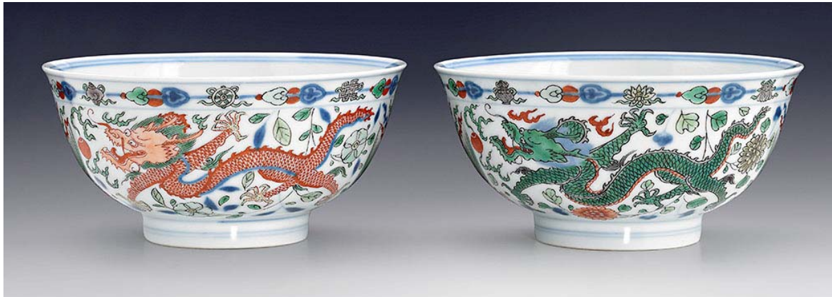
A PAIR OF WUCAI 'DRAGON AND PHOENIX' BOWLS MARKS AND PERIOD OF KANGXI. SOLD FOR $195,200 JUNE 2013

Sotheby's Australia recorded another successful sale of Fine Asian, Australian & European Arts & Design tonight at their Melbourne premises. The auction achieved a total of $1,506,334 including Buyer's Premium (IBP), or 60.26% by volume and 110.71% by value. The carefully selected collection comprised 229 lots of exquisite Chinese ceramics; designer furniture; European glass and silver; Australian and European paintings and works on paper.